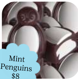
Mint Penguins $8