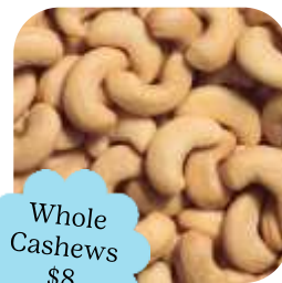
Whole Cashews $8