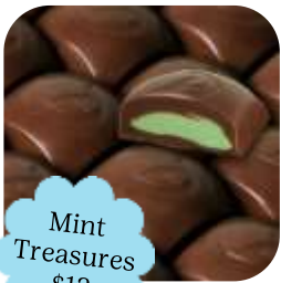
Mint Treasures $12