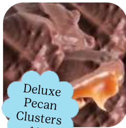
Deluxe Pecan Clusters $12