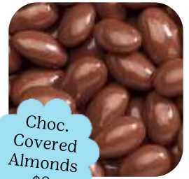
Choc. Covered Almonds $8