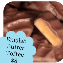
English Butter Toffee $8