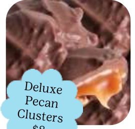
Deluxe Pecan Clusters $8