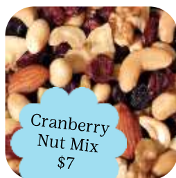
Cranberry Nut Mix $7