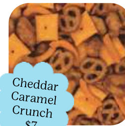
Cheddar Caramel Crunch $7