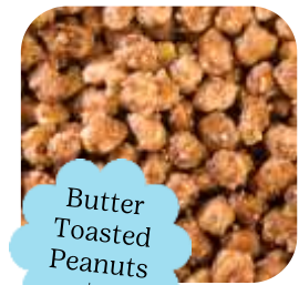
Butter Toasted Peanuts $7