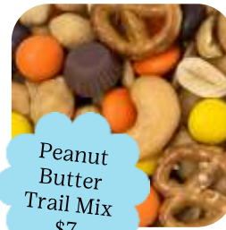
Peanut Butter Trail Mix $7