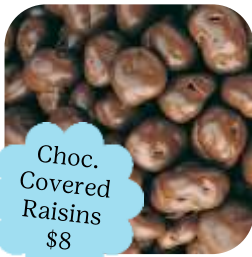
Choc. Covered Raisins $8