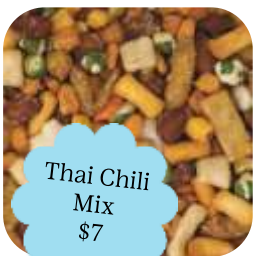
Thai Chili Mix $7