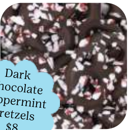
Dark Chocolate Peppermint Pretzels $8