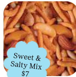
Sweet & Salty Mix $7