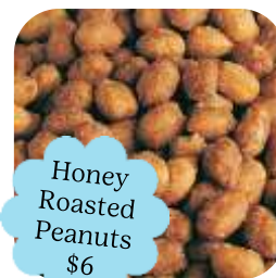
Honey Roasted Peanuts $6