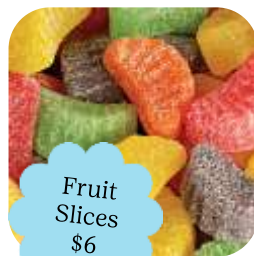
Fruit Slices $6