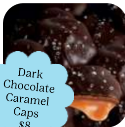
Dark Chocolate Caramel Caps $8