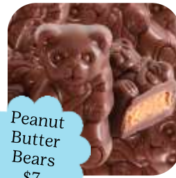
Peanut Butter Bears $7