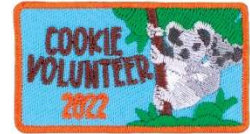
Volunteer Patch- 1 per TCM