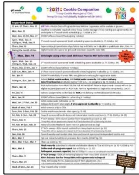
TCM Companion- 1 per TCM