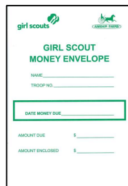
Money Envelope- 1 per girl