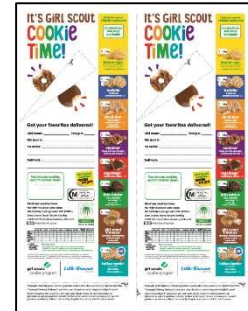
Door Hangers- 2 sheets per girl