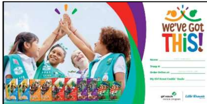
Order Card- 1 per girl