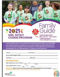
Family Guide- 1 per girl