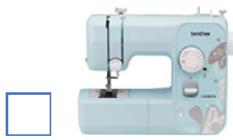
Sewing Machine (style/color may vary)