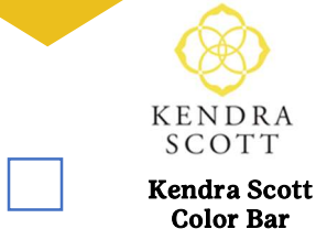
Kendra Scott Color Bar