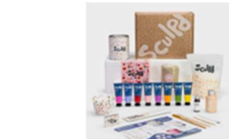
Sculpd Candle Making Kit (style/color may vary)