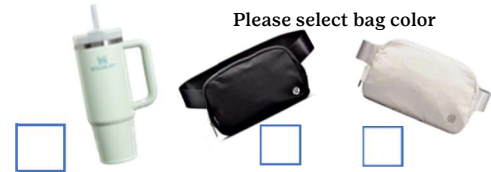
Girl on the Go: Lululemon Belt Bag & 30 oz Stanley Cup (Black or white belt bag, Stanley color may vary)