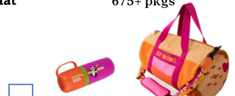
Weekender Duffle & Travel Case w/ Toothbrush 1000+ pkgs

Girl Scouts will receive any rewards she earned/ chosen at 1600+ level, all patches & an invite to the 1300+ Movie Party!