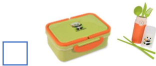
Panda Bento Box & Take-Along Utensil Set 750+ pkgs