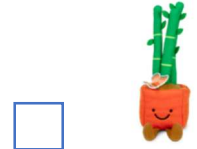
Happy Bamboo Plush 250+ pkgs