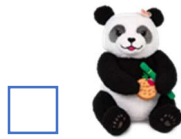
Pand-dorable Plush 450+ pkgs