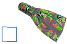
Cooling Headband 60+ pkgs

Lower-level rewards: Please check the ONE lower-level reward you would like to receive. You will receive any earned patches at these levels.