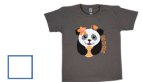
Do-sí-dos T-Shirt 675+ pkgs