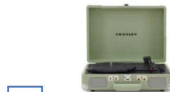
Record Player (style/color may vary)