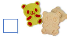
Panda-yum Sandwich Shaper 150+ pkgs