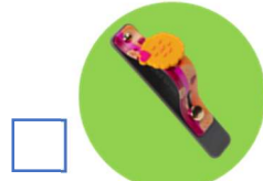
Handle with Pop-in Charm 90+ pkgs