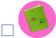
Charm-Collector Journal w/Pop-in Charms 375+ pkgs